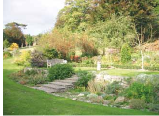
ABOVE: The garden at Hill Lodge, Northend LEFT: One of the gardens open at Avoncliff

The garden at 8 Trossachs Drive, Bathampton, has terraced gardens with wonderful views over Bath – and for a Sunday